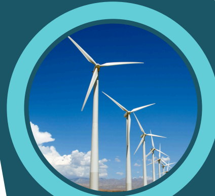
ENVIRONMENTAL & ENGINEERING