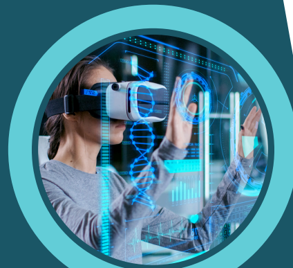
TECHNOLOGY & DESIGN