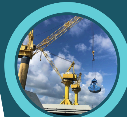
SUPPLY CHAIN INFRASTRUCTURE